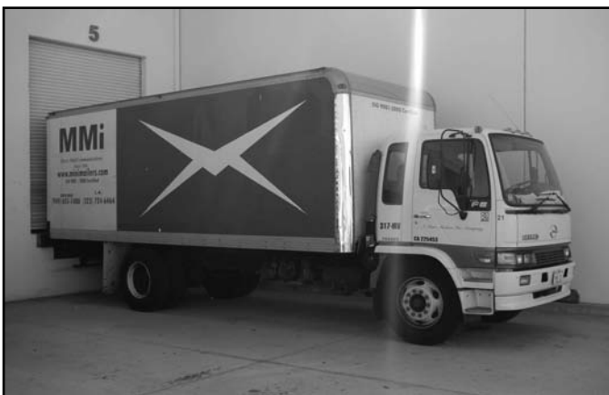
One of (2) Bobtails

(2) (1999) Freightliner FL-170 Bobtails , 7-Speed, 6.9L Engines, Lift Gates.