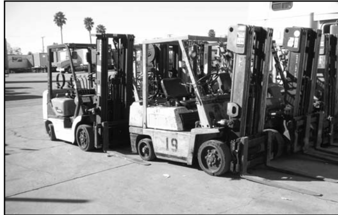
Partial View of Forklifts

Komatsu FG25/ST-14 Forklift, Solid Tires. S/N 584996