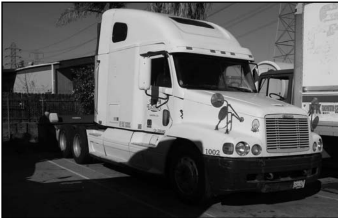
One of (12) Tractors

(3) (2000) Freightliner Century Tractors , N14 Engines, Super 10-Speed, Sleepers.