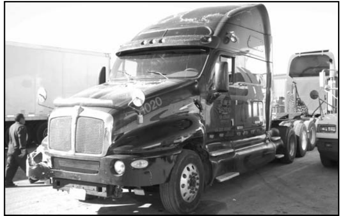
One of (12) Tractors