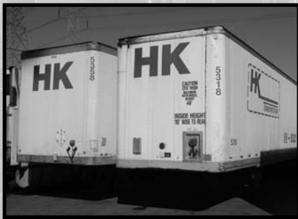
Partial View of 53' Trailers

From Downtown LA, Take The Harbor Fwy. (110) South to CA-91 West, Continue on Artesia Blvd. to S. Normandie Ave., Left on Normandie to W. 178 th St., Right on 178th To Sale Site!!!