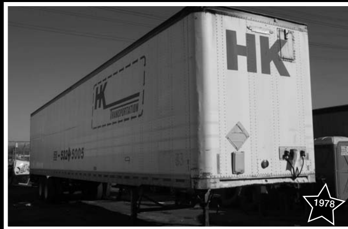
One of (40) 53' Trailers

For An Auction Calendar Visit Our Website: www.tauberaronsinc.com