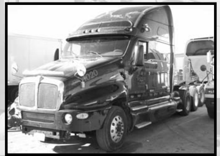
One of (12) Tractors

THURSDAY, FEBRUARY 16, STARTING AT 10:30AM