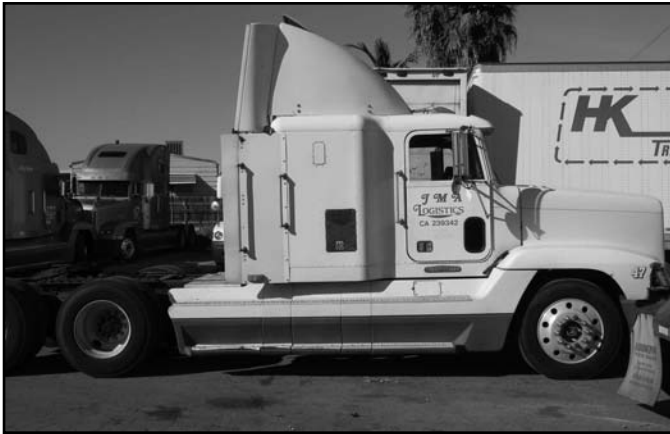
One of (12) Tractors