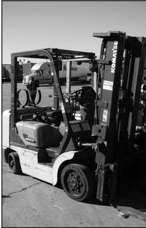
One of (8) Forklifts