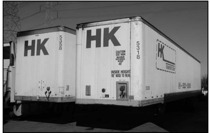
Partial View of 53' Trailers