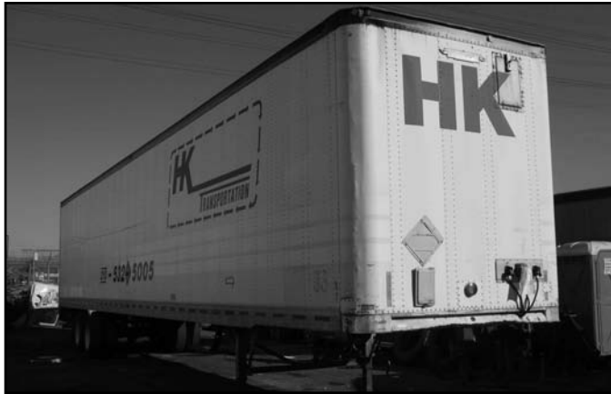
One of (40) 53' Trailers